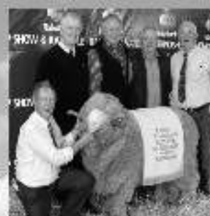
One Oak 116 "George" Rabobank Australian Ram of the Year 2013