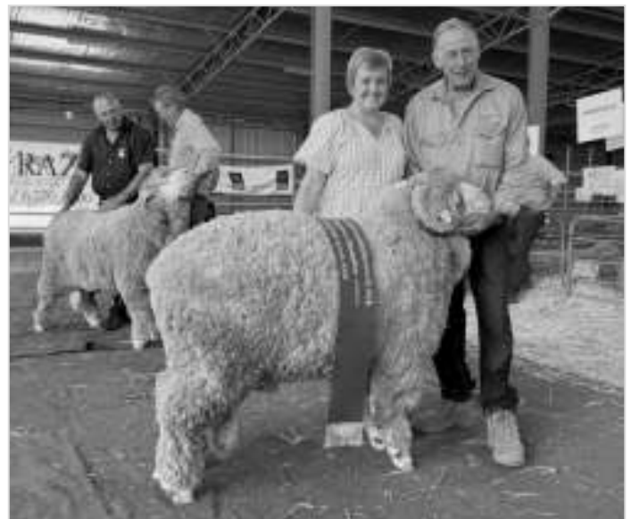
2024 Reserve Champion Superfine Ram — Pomanara