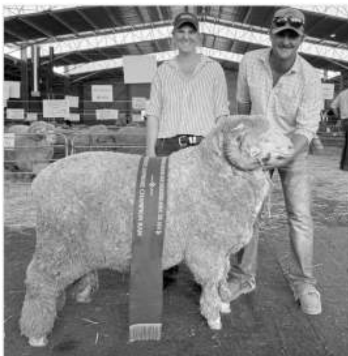
2024 Reserve to Supreme — Shalimar Park