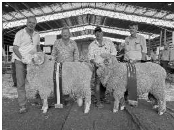
2024 Champion Fine Medium Ram — Merryville, and Reserve — Airlie.