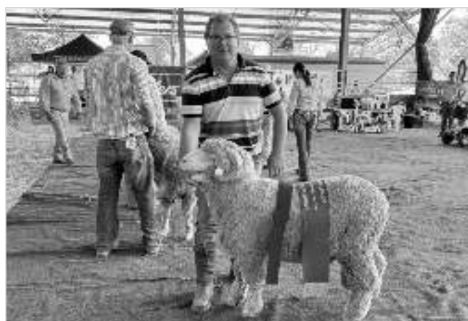
2024 Reserve Champion August Shorn Merino Ram — Grathlyn