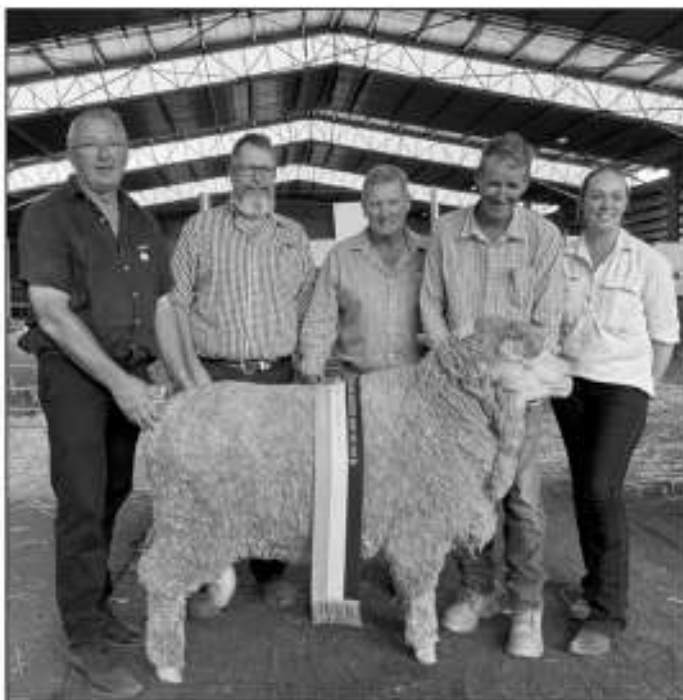
2024 Grazag and Bayer Supreme Exhibit — Bocoble