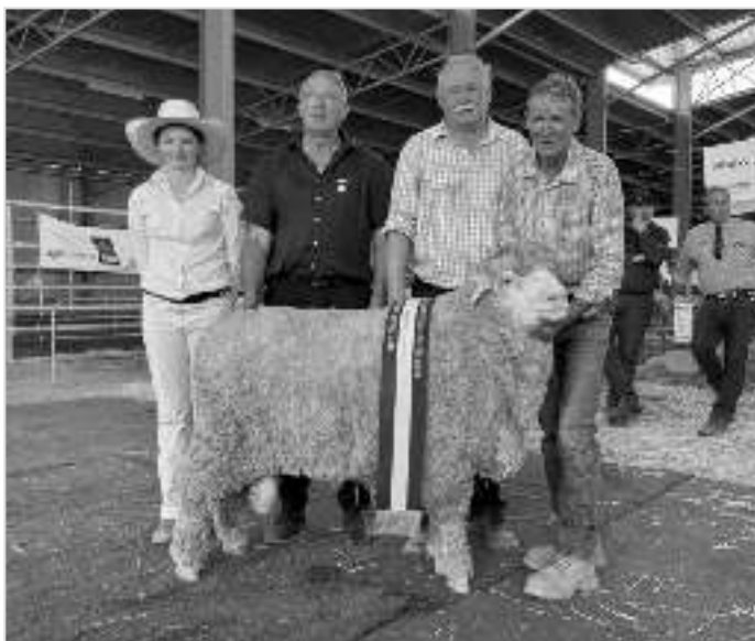
2024 Champion Superfine Ram — Bocoble

Bocoble is offering one stud ram , August Shorn, with an average adult fleece line over five years of 17.0 microns.