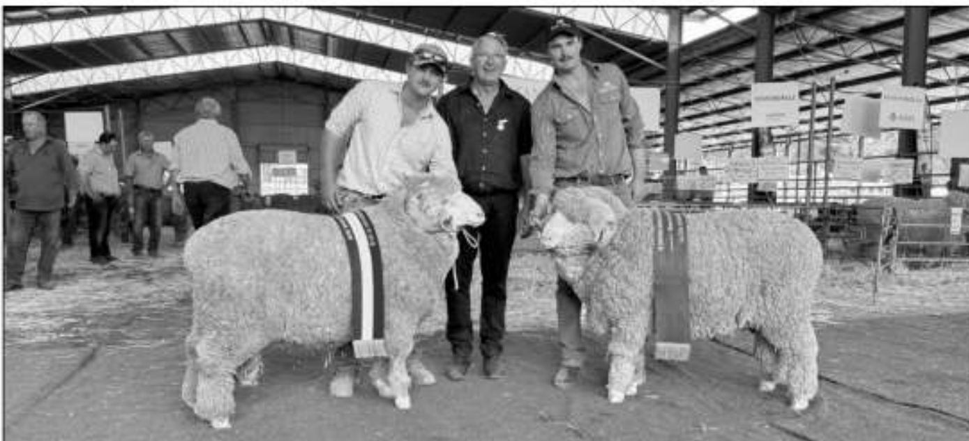
Champion Ultra Superfine Ram — Shalimar, and Reserve — Westvale