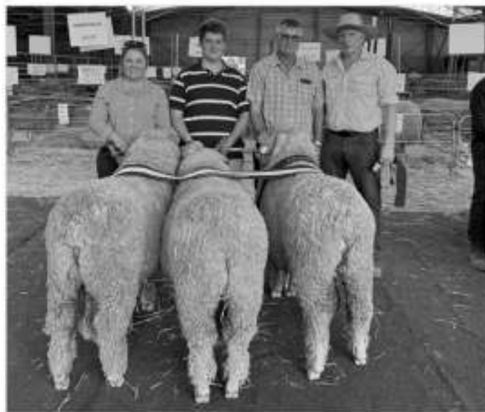
2024 Champion Pen of Three Rams — Glenbrook