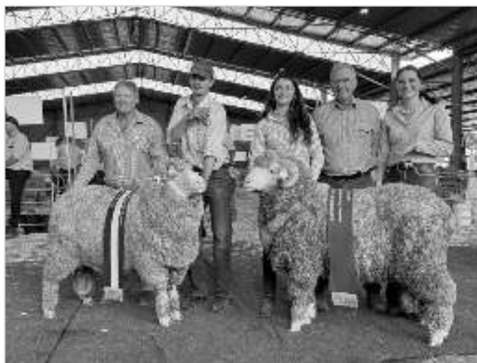
2024 Champion Fine Wool Ram — Queenlee, and Reserve — Hollow Mount.